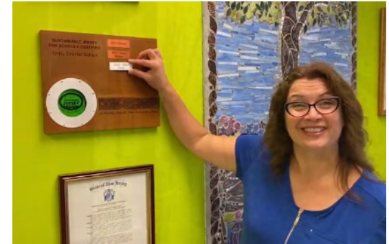
Unity Charter School – 2020 Silver