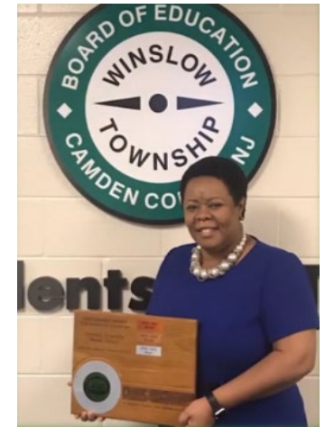
Winslow Twp Middle School – 2020 Silver

http://www.sustainablejerseyschools.com/actions-certification/certification-overview/2021-application-cycle/