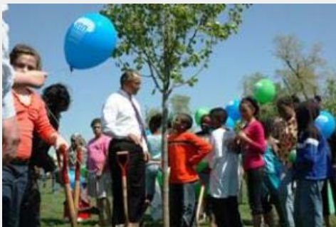
Columbus, OH Sustainability Plan, Columbus GreenSpot via The Planning Tool Exchange

ARTICLE | MARCH 22, 2012 - 2:00AM | BY REBECCA SANBORN STONE