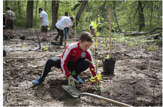
With funding from a 2018 Roots for Rivers Reforestation grant, 125 volunteers came together to plant over 700 new trees and shrubs along the Passaic River during Chatham Borough's annual Spring Clean

Application Deadline: Friday, December 13, 2019.