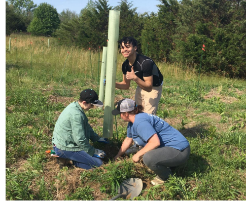
In 2018, Schalick High School in Pittsgrove School District partnered with South Jersey Land & Water Trust and the American Littoral Society to expand the forested buffer of a nearby tributary with a Roots for Rivers grant

Program participants will receive technical assistance to design restoration projects and funding to cover the material costs of eligible expenses that only include native tree/shrubs, tree protection tubes, stakes and up to two delivery fees. All other expenses will be the financial responsibility of the applicant. Projects costing between $1,000 and $20,000 are eligible. Click here for more information. We encourage applicants to review the Information Application Packet here and sign up to participate in the informational webinar before submitting the application.