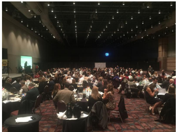
300+ Green Team members and school officials gather for the 2016 Sustainable Jersey for Schools Awards Ceremony at the NJSBA Workshop.