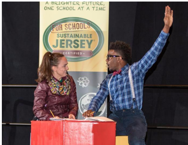
The George Street Playhouse presents excerpts from " Gabi Goes Green "