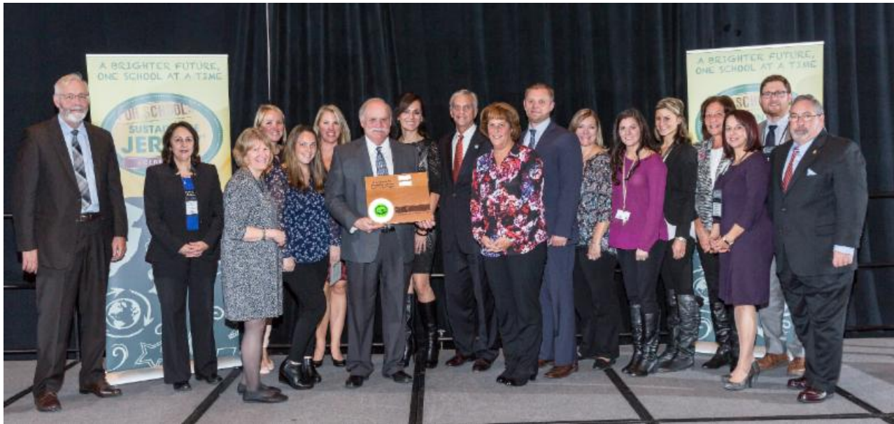
Reeds Road Elementary accepts the 2016 Elementary School Champion Award.