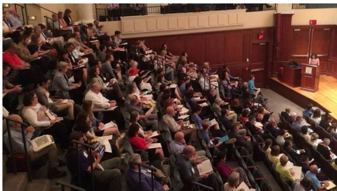
Plenary Session 2017

New Jersey's premier sustainability event is back! The New Jersey Sustainability Summit will be hosting expert speakers and case studies on community approaches to energy, balancing sustainability with social equity, capacity building for school and municipal green teams, reducing single use plastics, and other topics essential to our individual and collective well being. For more information, click here .