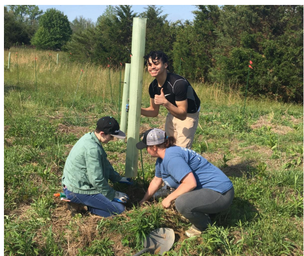
In 2018, Schalick High School in Pittsgrove School District partnered with South Jersey Land & Water Trust and the American Littoral Society to expand the forested buffer of a nearby tributary with a Roots for Rivers grant

Application Deadline: Friday, December 13, 2019.