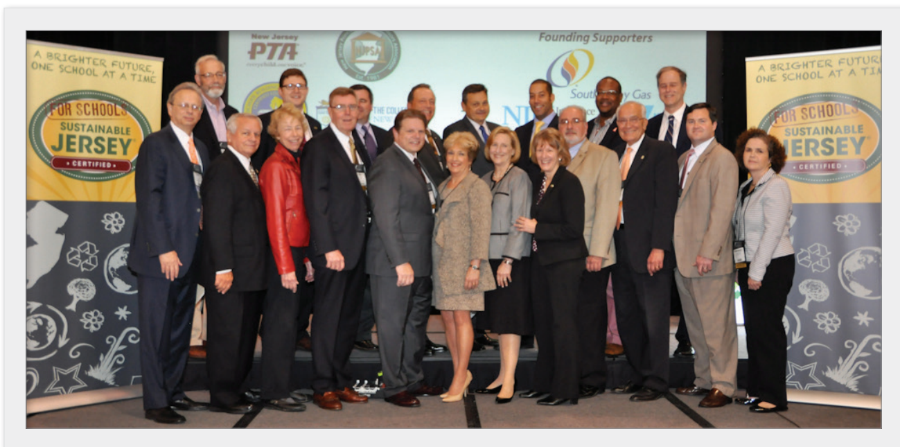
Sustainable Jersey for Schools program launch October 2014