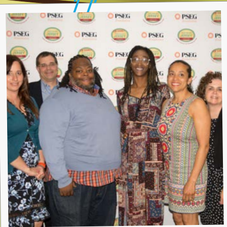
Earn recognition and funding for your school

Application and webinar links: bit.ly/SchoolsPSEGGrants