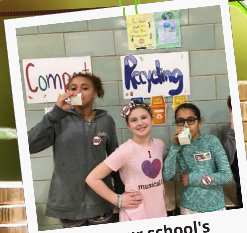
Support your school's efforts to be sustainable