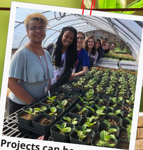
Projects can be used to gain certification points