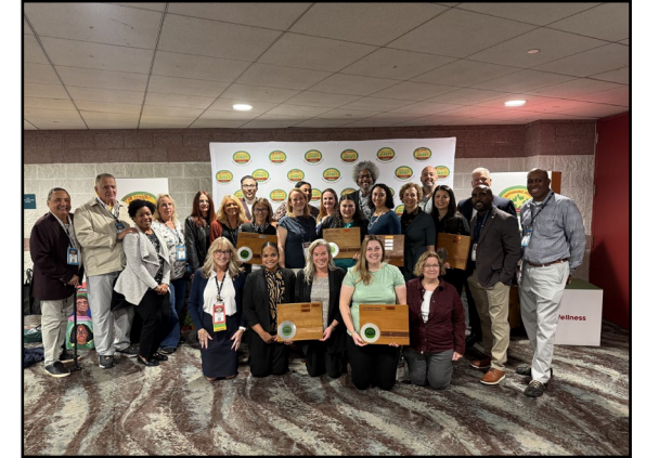
Franklin Township Public Schools 3 Silver, 4 Bronze