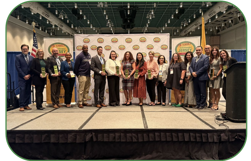
2025 Digital Schools Star Recipients

https://www.sustainablejerseyschools.com/actions/digital-schools-program/digital-schools-star-recognition/