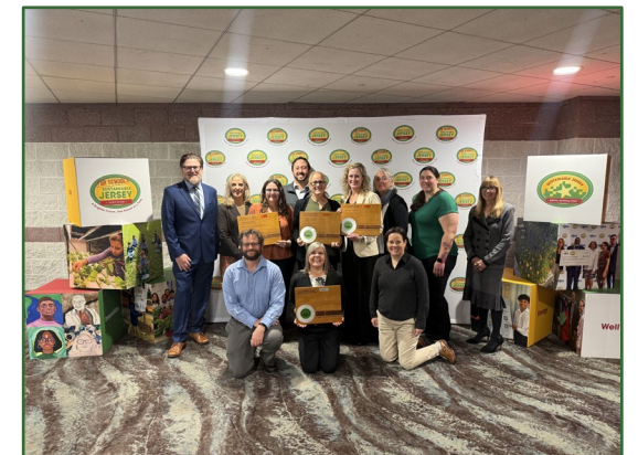
Clinton Township School District All schools Certified, 1 silver, 3 bronze